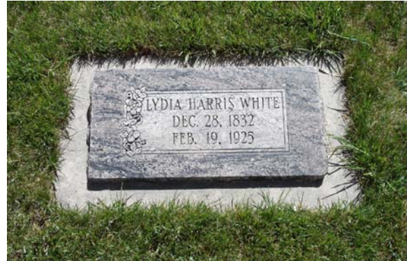
Figure 5 Headstone of Lydia Harris White

Continuing, when I did my search for relatives buried in the Beaver Cemetery there were nineteen persons born before 1900, as previously mentioned, and another five that came up who were born since 1900. Of these 24 people that came up in our search, eleven of them were direct line ancestors. The others were brothers or sisters of our direct relatives. These eleven direct line ancestors are shown in Figure 7; seven of these relatives are mine, the other four are Rebecca's.