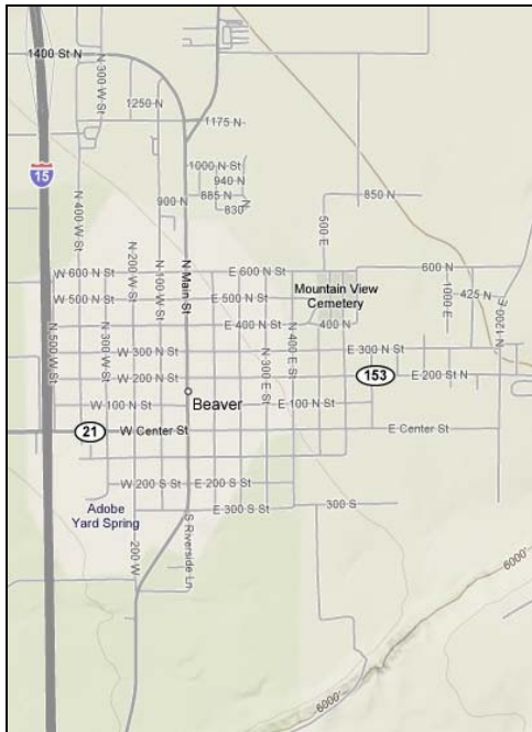
Figure 1 Mountain View Cemetery, Beaver, Utah

If you are like us you have family all over Utah and the trip from St. George to Salt Lake becomes a regular event. I have no idea how many times I have driven this stretch of I-15, perhaps as many as one hundred times. Now that we have kids, making the trip in a single stretch is quite tiring for all. We have found that a few short stops make the trip a lot more enjoyable.