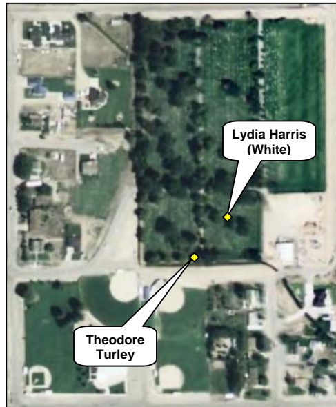
Figure 3 Mountain View Cemetery (Google Earth)

on define. A new dialog will pop up labeled Field Filtering. Pick “Burial Place” and then enter the city you are interested in visiting. Click okay on both dialogs so you are back at the Find Individual dialog box. If you click on “Show results only” on the third section, Filtered List, the list of individuals in the upper part of the dialog box will now show only those persons in your PAF file that are buried in the location you have selected. For us, we chose Beaver as the location and I entered a second filter of persons born before 1900; nineteen matching individuals appeared.