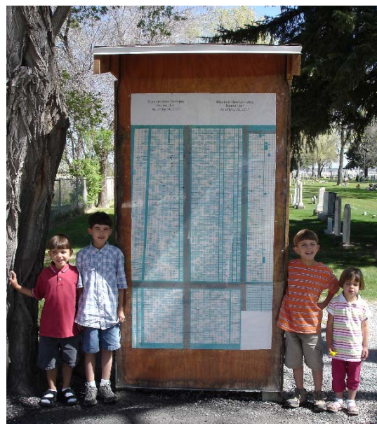
Figure 4 Mountain View Cemetery Index

I have to admit, on this particular trip I went with my memorized list (in my head), rather than a PAF list (after you spend a couple years with your PAF files you will find that you end up memorizing much of it without even trying). We stopped at the cemetery for about an hour and walked all over it. The kids really enjoyed searching for their ancestors. We were able to find about half the people on our list just by wandering around. Then Robbie found a cemetery index and plot map near the west entrance. It lists every person buried in the cemetery, in alphabetical order, on one side and then shows where their grave plot is located on the other side. Using this we were able to find the last few people we were searching for (and we all got to stretch our legs).