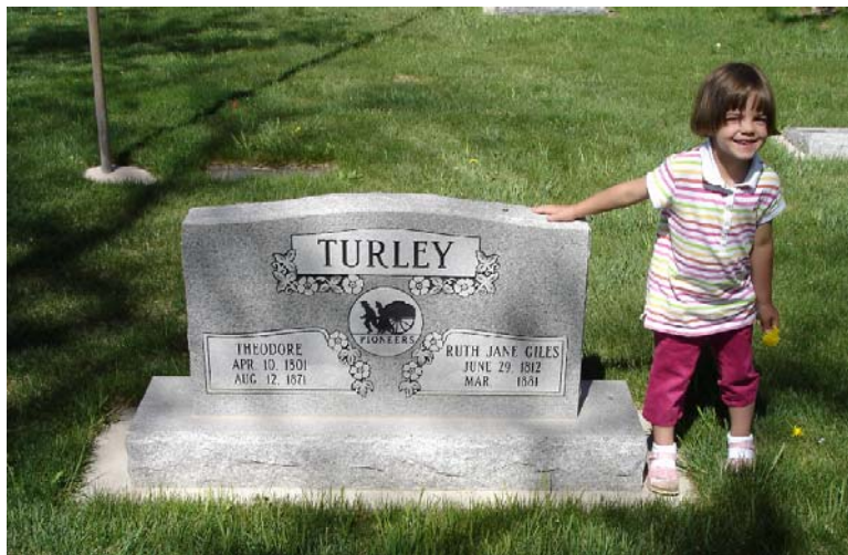
Figure 6 Headstone of Theodore Turley

We have included a photograph of the headstone of two of these: Lydia Harris White, a descendant of Moses Harris who was the founder of Harrisburg, Utah and a very early pioneer of Washington County; and Theodore Turley, a famous early Saint perhaps best known for having built the first house in Nauvoo (Commerce at the time) and for his service as a Seventy in the early days of the Church. The location of their headstones is shown on Figure 3, which is an aerial photograph of the cemetery from Google Earth.