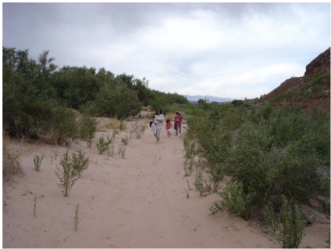
Figure 3 The Whole Family, Further Up the Trail, Looking West / Southwest

families (the Staheli Family was one of the Swiss Immigrants that settled in Santa Clara in 1861). When he heard about our interest in the dam, and our non-profit, he offered me his grandma's phone number and told me she had some really cool pictures of the old dams and such. He told us that he had seen it and that it was further upstream still about another half mile. He said it was easier to access from the other side of the river, but we will save that trail for later, when we actually go down to the old dam and write about its history. On the way back we were in the water a lot more. It was a perfect day and the water was so cool and nice.