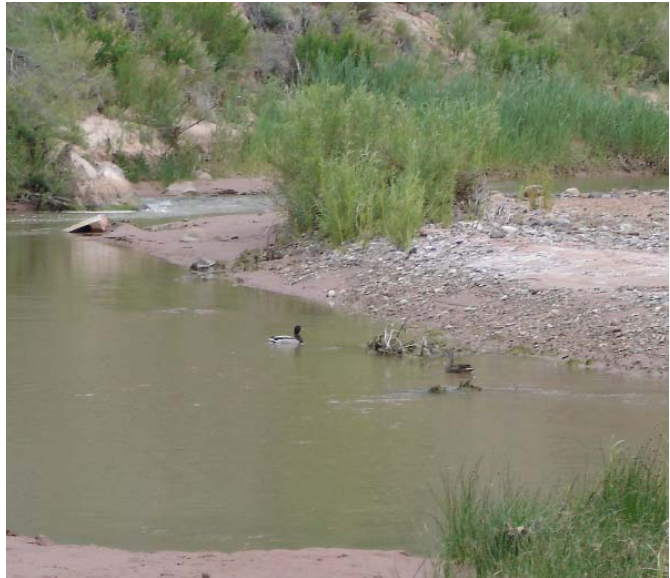
Figure 7 A Male & Female Mallard Duck Swimming in the River (the male, with the green head, is easy to see, the female is to the lower right)