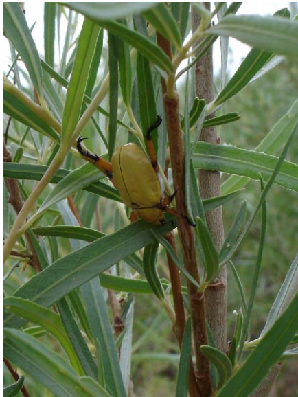
Figure 6 Huge Beetle Hanging Out in the Willows (its body was about 1.5 inches long)

Flora: lots of bushes and flowers, cottonwoods, tamarisks, and willows.