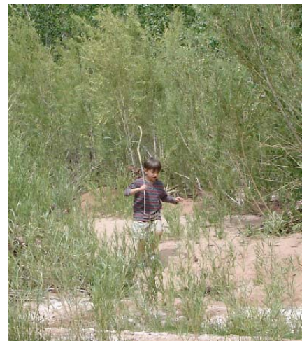
Figure 9 A Local Savage (he is not as dangerous as he looks, we fed him and then he stopped causing trouble, another successful application of Brigham Young's counsel on Indian relations)