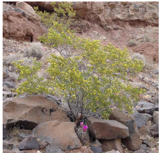
Figure 5 The Desert's Contrasts: Beautiful Blooms Backdropped by Jagged Rocks & Rugged Cliffs

The first part of our hike, the squiggly line shown on the map, was about 3/4 mile each way (1.5 miles round trip). The second part of our hike, not shown, was about 1/4 mile each way (0.5 mile round trip). So all in all we got a pretty good workout (free exercise, but don't tell the guys that work at the Summit Athletic