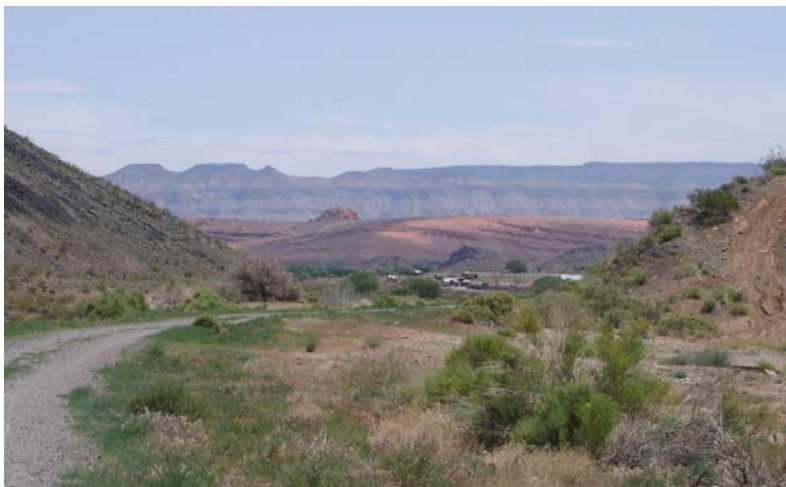
Figure 8 A Beautiful View Looking East Toward Sand Mountain (this picture is actually on the second trail, which we will cover when we find the dam)