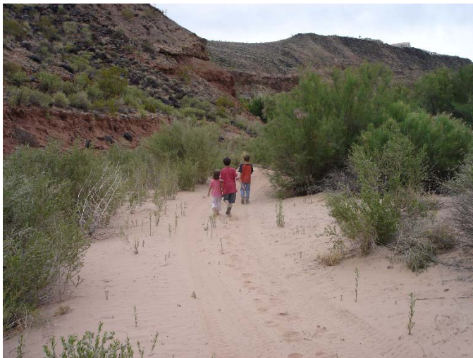
Figure 4 The Kids Running Ahead, Looking East / Northeast

Club). Even though we don't know if we ever saw the remnants of the old dam, we did have a lot of fun and we saw some other cool things. Following is a list of some of the plants and animals we saw, and a few pictures. Over time I will try to learn the scientific names of more of these things and other interesting tidbits, but for today it will just be pictures.